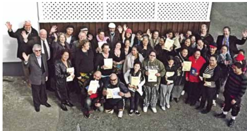
Graduates from the 46th CiH course held in Porirua.

For more than 11 years the Porirua City Community IT Educational Trust (PCCITET) has provided targeted IT training for parents in our city who do not have a job or don't own a computer. In addition, the Trust assists low decile schools in Porirua City to obtain a higher ratio of computers to students and provides computers to Community Access Points (CAPs) around the wider city. The 11 CAPs provide access in a variety of existing ethnic, cultural, community, educational and religious organisations, together with a mobile training unit.