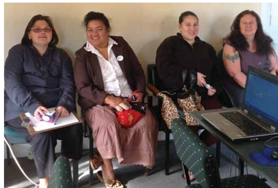
Participants in the Link House Computers in Homes programme in Hamilton.

One of the real success stories of the programme this year was the development of a Computers in Homes course for single-parent families. Statistically, these families represent 60 percent of those under the poverty line and can struggle to put food on the table, let alone provide a computer for their children. Two organisations that provide services for single parents – Birthright Waikato and Link House – collaborated to deliver this programme to 26 whanau during the year. In their final surveys, recipients said their skills had been upgraded, they had found the learning environment supportive, they had gained confidence and were glad they'd done the course. As one participant summed it up: "This is one awesome course you could ever jump on."