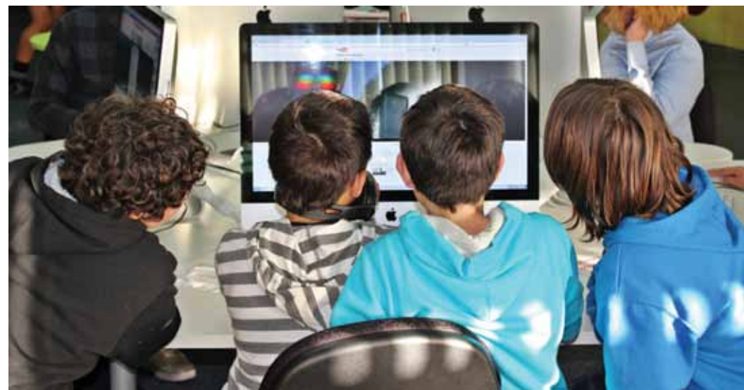
Learning new ICT skills and connecting with others at the Ake Ake Community Technology Centre.

The work of Digicom aligns with the vision of the Wanganui Digital Leaders Forum – Digicom is the community reference group. The forum comprises 10 sector groups whose goal is making the most of the opportunities offered by Wanganui's ultra fast broadband network.