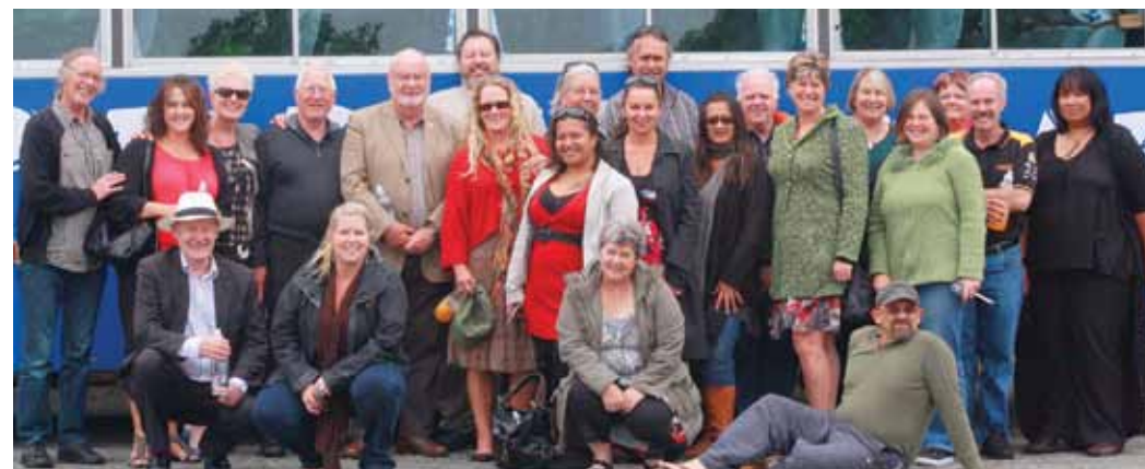
CiH coordinators in Kapiti for their quarterly hui in March 2012

is to give refugee children and their families access to online educational resources as well as empower refugee families with computing tools and skills so they can be active participants in the online world.