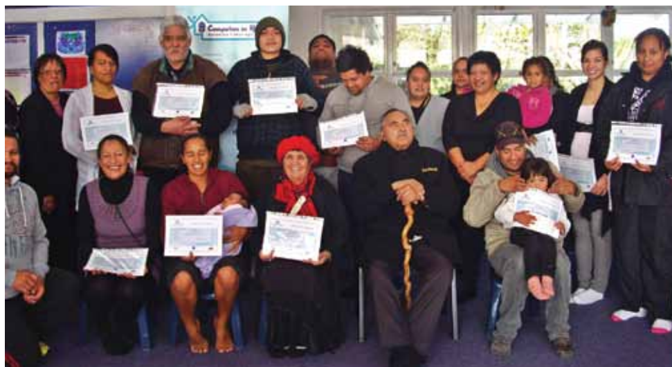
Some of the graduating class at Te Wharekura o Maniapoto in Te Kuiti, with their tutor and other support people.

We are on Facebook: www.facebook.com/taranaki.elearningtrust .