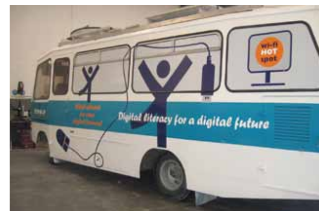
DORA, the mobile learning centre being equipped to bring internet and Stepping UP training to earthquake damaged areas of Christchurch.