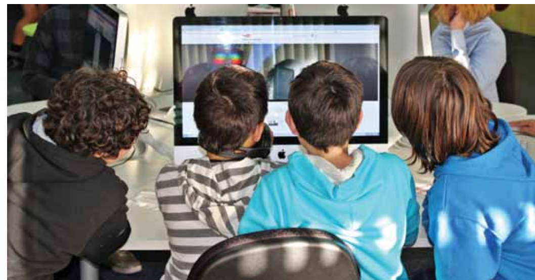
Learning new ICT skills and connecting with others at the Ake Ake Community Technology Centre.

The work of Digicom aligns with the vision of the Wanganui Digital Leaders Forum – Digicom is the community reference group. The forum comprises 10 sector groups whose goal is making the most of the opportunities offered by Wanganui's ultra fast broadband network.