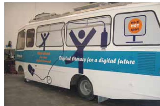
DORA, the mobile learning centre being equipped to bring internet and Stepping UP training to earthquake damaged areas of Christchurch.