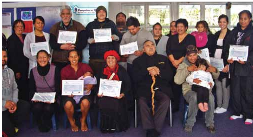
Some of the graduating class at Te Wharekura o Maniapoto in Te Kuiti, with their tutor and other support people.

We are on Facebook: www.facebook.com/taranaki.elearningtrust .