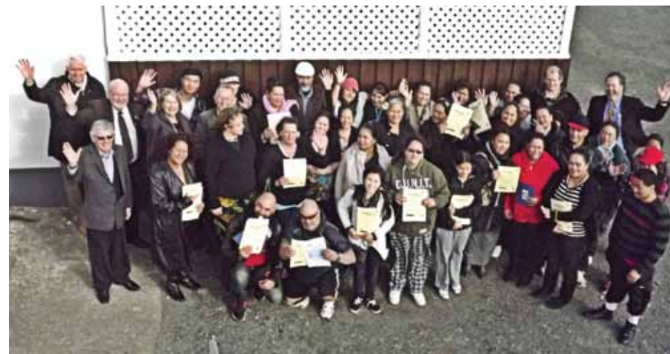
Graduates from the 46th CiH course held in Porirua.

For more than 11 years the Porirua City Community IT Educational Trust (PCCITET) has provided targeted IT training for parents in our city who do not have a job or don't own a computer. In addition, the Trust assists low decile schools in Porirua City to obtain a higher ratio of computers to students and provides computers to Community Access Points (CAPs) around the wider city. The 11 CAPs provide access in a variety of existing ethnic, cultural, community, educational and religious organisations, together with a mobile training unit.