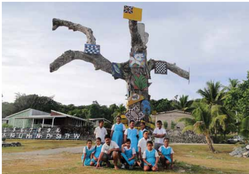
Niue Primary School students who participated in the Pacific Living Heritage programme

Living Heritage continues to receive support from our partner, CWA New Media, which is now a division of Learning Media Limited. We appreciate this ongoing support as well as that of the National Library of New Zealand in hosting the Living Heritage resources. During 2011-12, a further twelve sites were published, bringing the total number of published stories to 124.