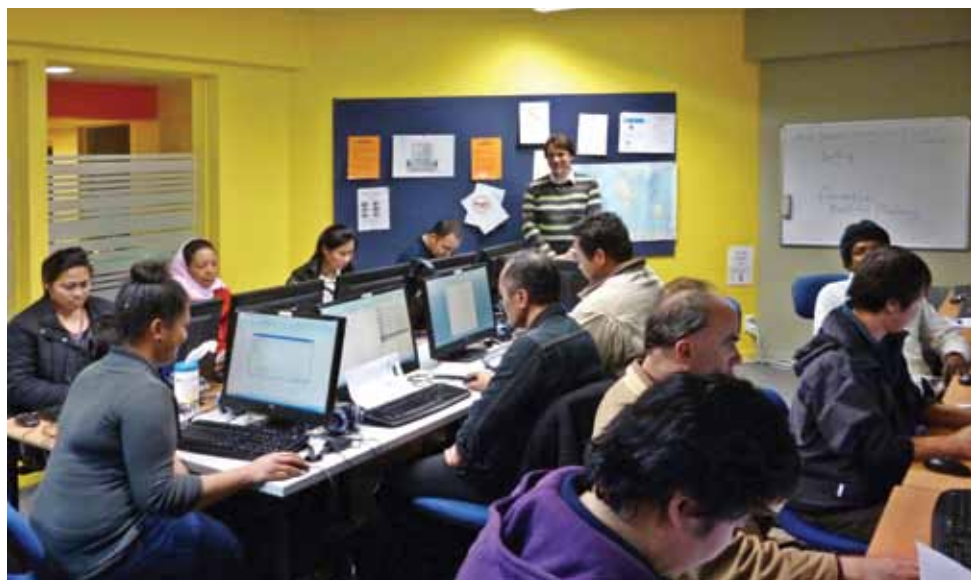
Stepping UP class run by English Teaching College in Wellington CBD.

Through its Webrider programme, Wellington ICT Trust ran free monthly Tech-Talks on various ICT and website-tools and trends. It also provided advice and consultancy support to community groups in need. Supported by a core group of skilled ICT volunteers, we are also delivering successful community website projects, as well as investigating telehealth and ICT shared services for the community sector.