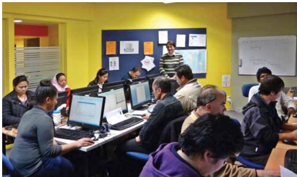
Stepping UP class run by English Teaching College in Wellington CBD.

Through its Webrider programme, Wellington ICT Trust ran free monthly Tech-Talks on various ICT and website-tools and trends. It also provided advice and consultancy support to community groups in need. Supported by a core group of skilled ICT volunteers, we are also delivering successful community website projects, as well as investigating telehealth and ICT shared services for the community sector.