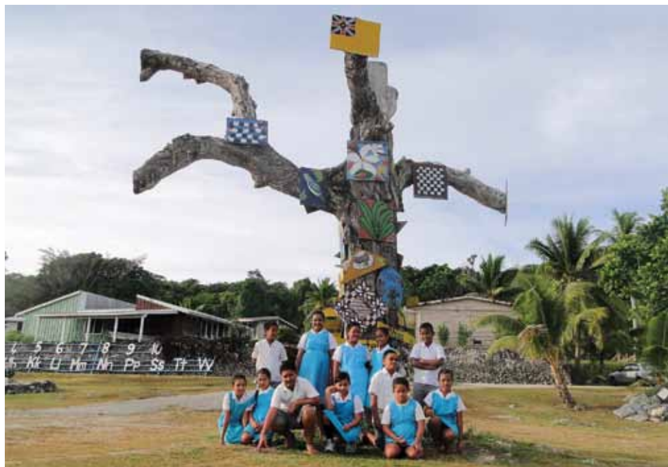
Niue Primary School students who participated in the Pacific Living Heritage programme

Living Heritage continues to receive support from our partner, CWA New Media, which is now a division of Learning Media Limited. We appreciate this ongoing support as well as that of the National Library of New Zealand in hosting the Living Heritage resources. During 2011-12, a further twelve sites were published, bringing the total number of published stories to 124.